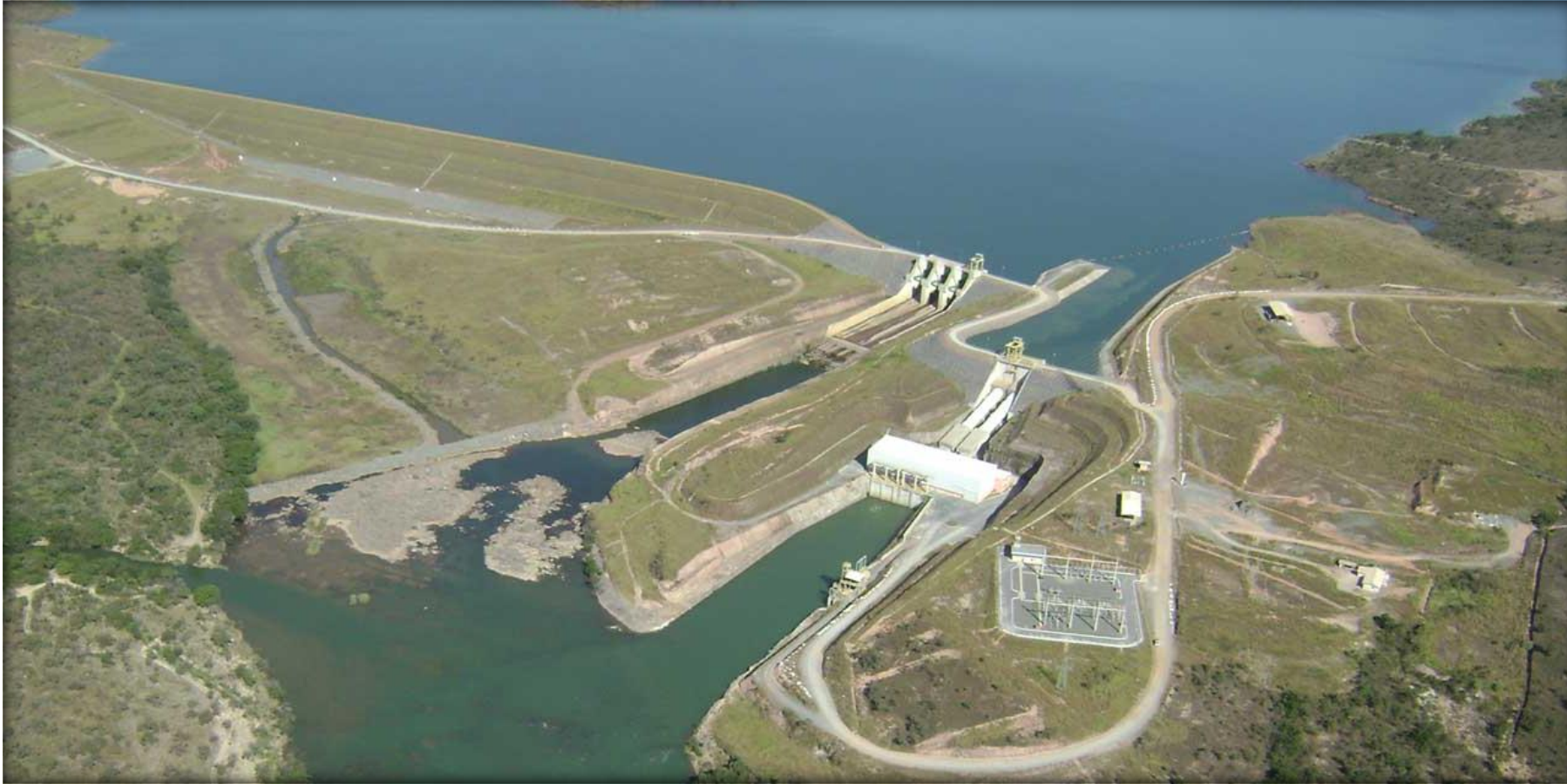
Hydro Power Plant